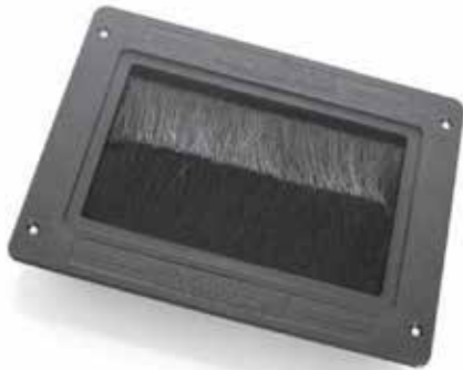
Integral - Part No. 1010