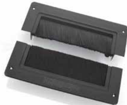
Split Integral - Part No. 3030